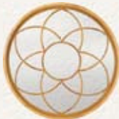
Custom Wood Full Round Window