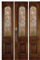
Custom Wood 112 Door

With reliable JELD-WEN® windows and doors, you can achieve architectural accuracy while ensuring lasting beauty and energy efficiency. So they're ideal for renovation projects. To learn more, request our Historic Renovation brochure by calling 1.800.877.9482 ext. 9966, or visit our website www.jeld-wen.com/9966 .