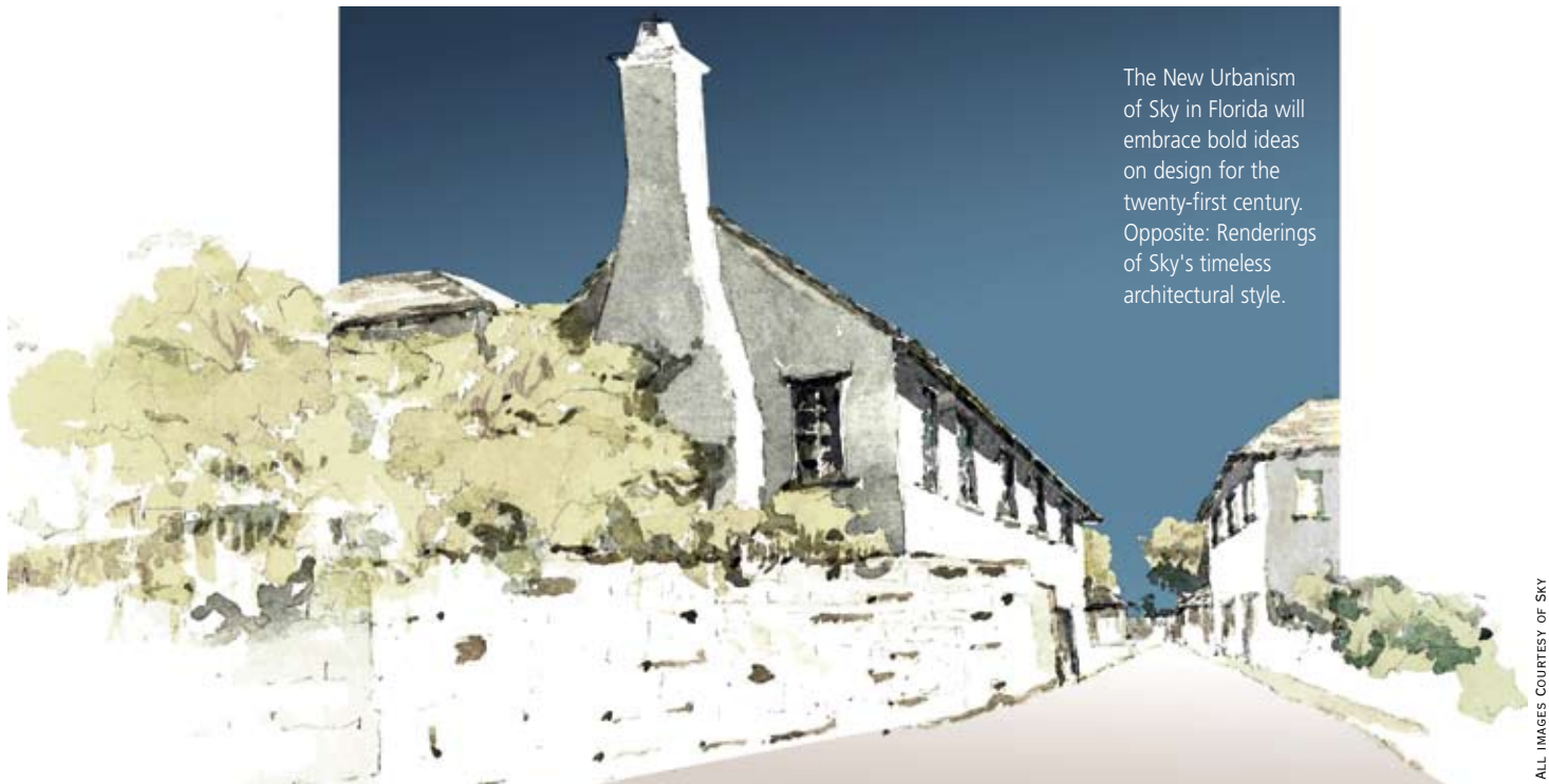
The New Urbanism of Sky in Florida will embrace bold ideas on design for the twenty-first century. Opposite: Renderings of Sky's timeless architectural style.

A New Urbanism development in Florida blends traditional southern architecture and agrarian life with big-city conveniences. TEXT BY NIGEL MAYNARD